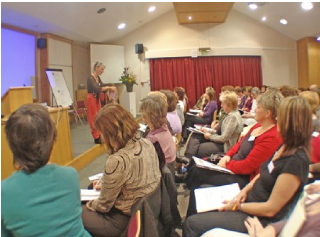
2005 National Conference at the end of Cycle One

The application aims to make the approach immediately useful in an everyday context, fitting snugly with the aims and demands of early years sector. It supports the four themes and principles of the Early Years Foundation Stage - a Unique Child, Positive Relationships, Enabling Environments, Learning and Development.