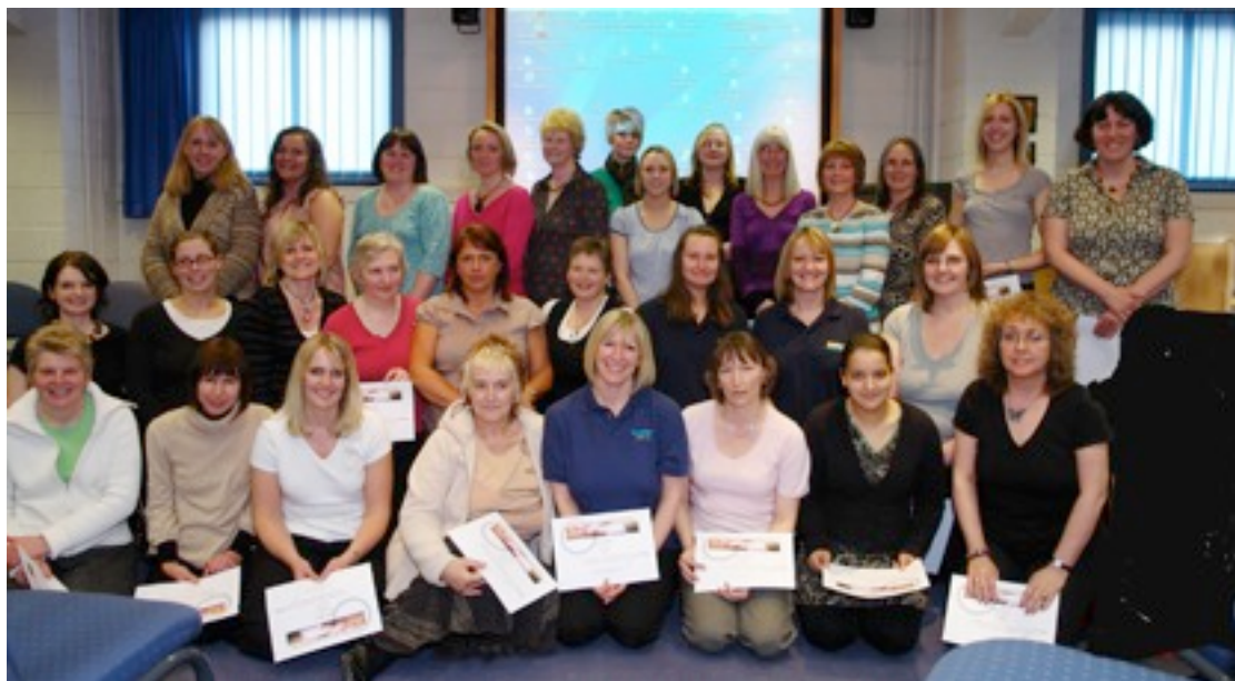
Kirklees DMP Project practitioners receive their certificates

It is important that to note this approach is the response of specialist dancers, bringing a new perspective and a new range of theory and skills to the field of child development and early education.